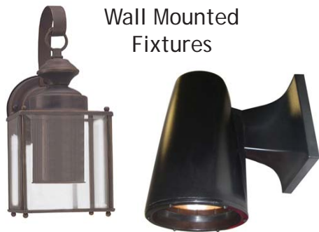
Wall Mounted Fixtures