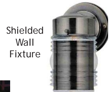
Shielded Wall Fixture