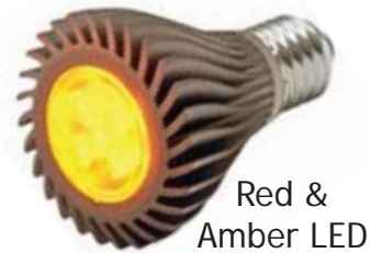
Red & Amber LED