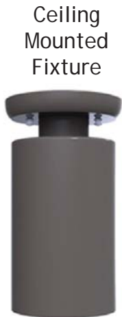
Ceiling Mounted Fixture

Beachfront lighting can also cause sea turtle hatchlings to become disoriented and wander away from the ocean towards the brightest lights. Hatchlings that head toward artificial lights often die from dehydration, exhaustion, terrestrial predation and passing cars.