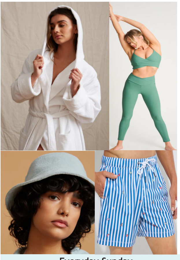
Everyday Sunday Apparel and swimwear to support STC. everydaysunday.com