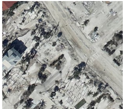
Hurricane Ian completely destroyed a single-family home on Estero Blvd. in Fort Myers Beach that had executed a lighting retrofit with STC.