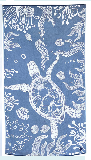
Turtle Beach Designs Hand-woven wool rugs. turtlebeachdesigns.com