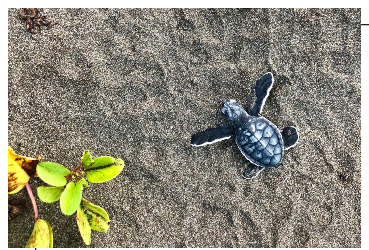
Green turtle hatchling in Tortuguero.