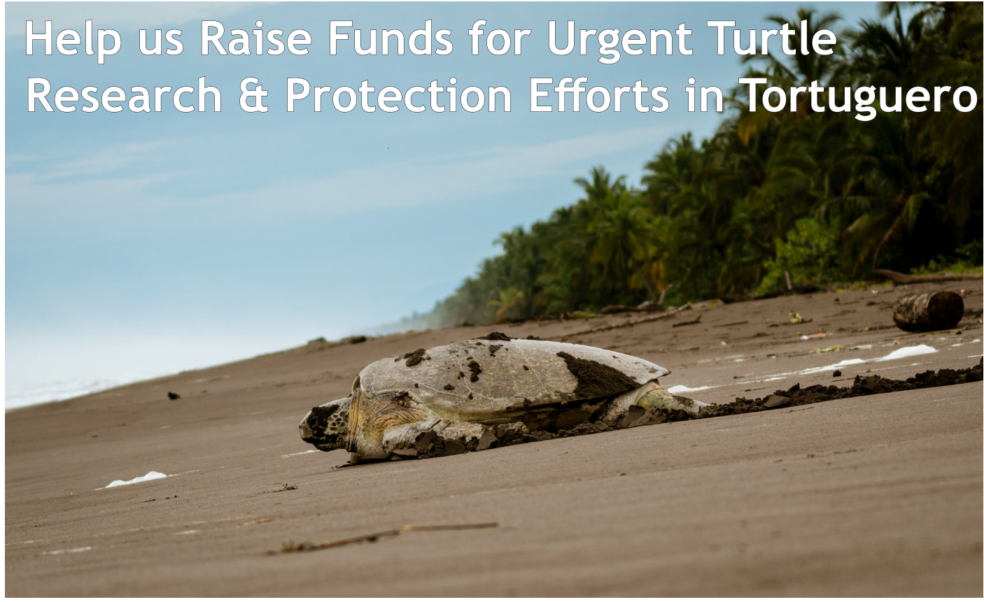
A green turtle returns to the Caribbean Sea after nesting in Tortuguero.

Each year for Giving Tuesday (the Tuesday after Thanksgiving), Sea Turtle Conservancy (STC) targets one of its most pressing sea turtle protection projects as the focus for this annual charitable event. The campaign starts with a pledge from STC's Board of Directors to match the individual donations provided by STC members and supporters, up to a certain amount. This year's challenge match from the Board will be about $30,000, which means our Giving Tuesday