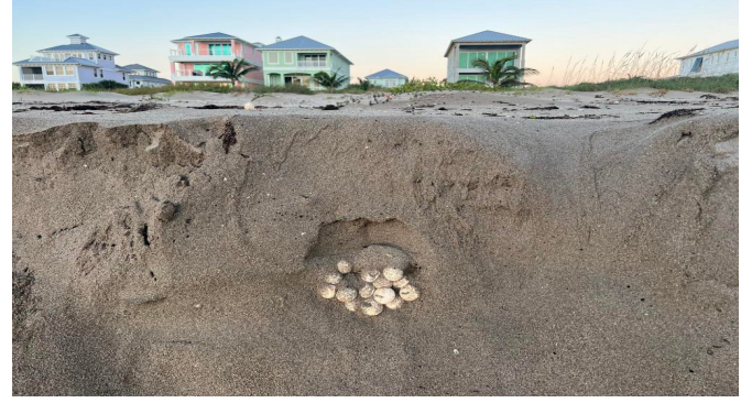
A sea turtle nest is exposed after high tides from a hurricane cause beach erosion.

government agencies may carry out. These include an increase in seawall and coastal construction projects that can impact nesting and reproductive success and exacerbate erosion. In a rush to encourage businesses back to fragile barrier islands as soon as possible, coastal governments may also approve hasty development plans in the same places that were just leveled by the storm. In the coming months, STC will closely watch these issues and, when necessary,