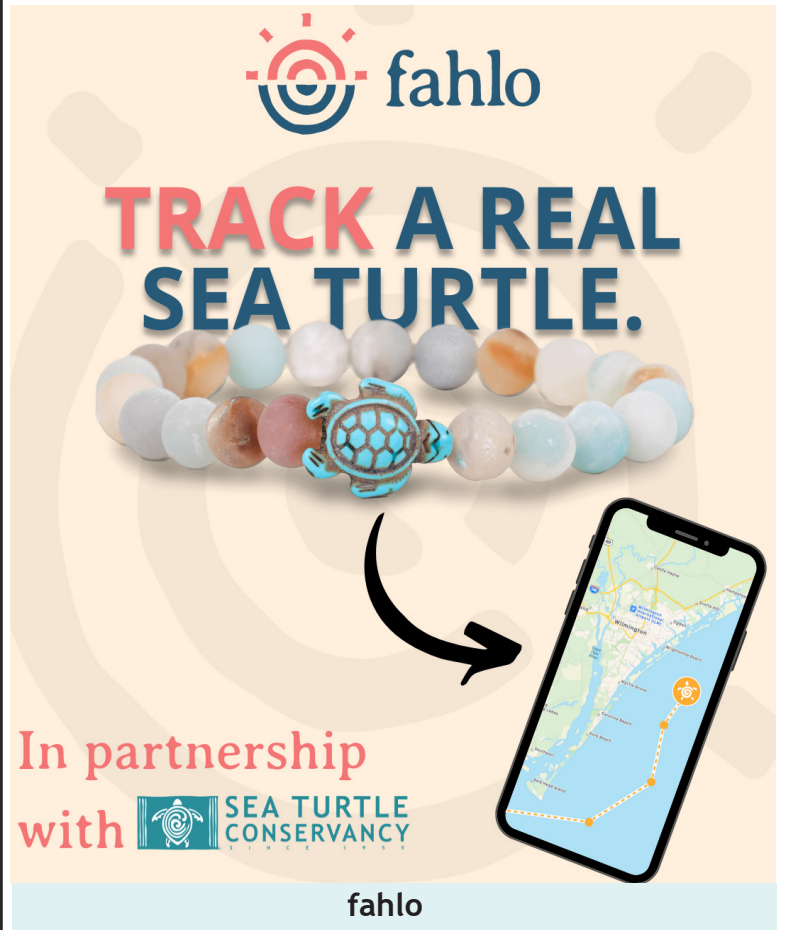
fahlo Each bracelet comes with an STC turtle to track! myfahlo.com

These companies give back to STC when you shop on their website! View all the companies that STC partners with at <a href="https://www.conserveturtles.org/partners">www.conserveturtles.org/partners</a>.