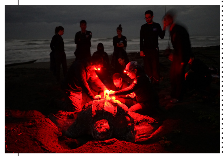
STC staff apply a satellite tag to a nesting leatherback in Panama

In May 2021, Hope was encountered nesting yet again but her new transmitter was no longer attached. It seems the attachment method failed or the transmitter came off while Hope was mating. We were hoping to encounter her yet again with a transmitter on hand but unfortunately it didn't happen. However, we were able to satellite tag five new leatherback turtles in Florida this year, and five more in Panama as part of the 2021 Tour de Turtles. These turtles are all available to track now at www.tourdeturtles.org . Read on to learn more about some of our new turtles!