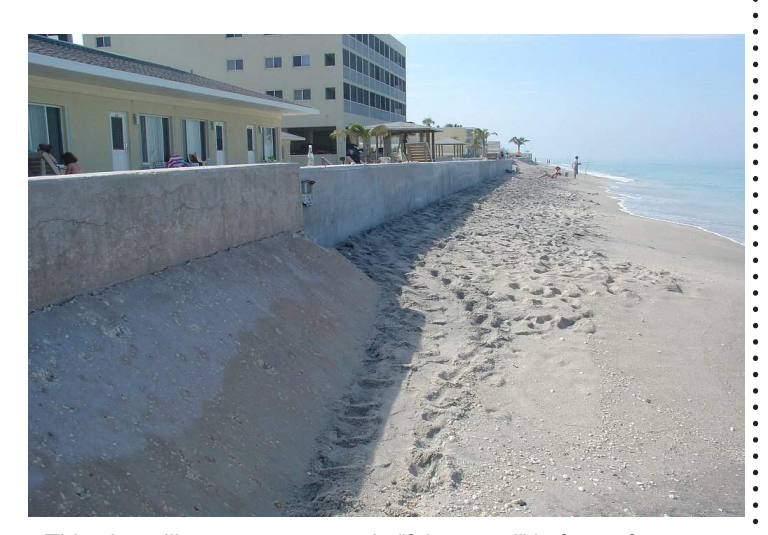
This photo illustrates a sea turtle "false crawl" in front of a sea wall. The nesting turtle tried to find a place to lay her eggs but instead crawled along the sea wall, using valuable energy, before returning to the ocean.

One of the bills (HB 1133 and SB 1504 – Coastal Construction and Preservation) sought to weaken the regulation of coastal armoring, which would have facilitated a rapid expansion of sea wall construction along important sea turtle nesting beaches in Florida. Seawalls block turtles from reaching the upper portion of the beach, causing them to nest in less-than-optimal nesting areas lower on the beach where their nests are more susceptible to waves and inundation.