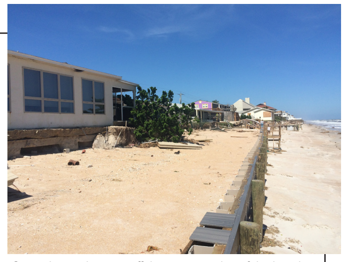
Coastal armoring cuts off the upper portion of the beach, causing sea turtles to lay their eggs in less optimal locations closer to the water.

In addition, studies have shown that fewer turtles emerge onto beaches with seawalls than onto adjacent, non-walled, natural beaches. Sea walls also disrupt natural beach dynamics and increase the rate of erosion down the beach. This can create a 'domino effect' that necessitates more and more seawalls, destroying sea turtle and shorebird nesting habitat.