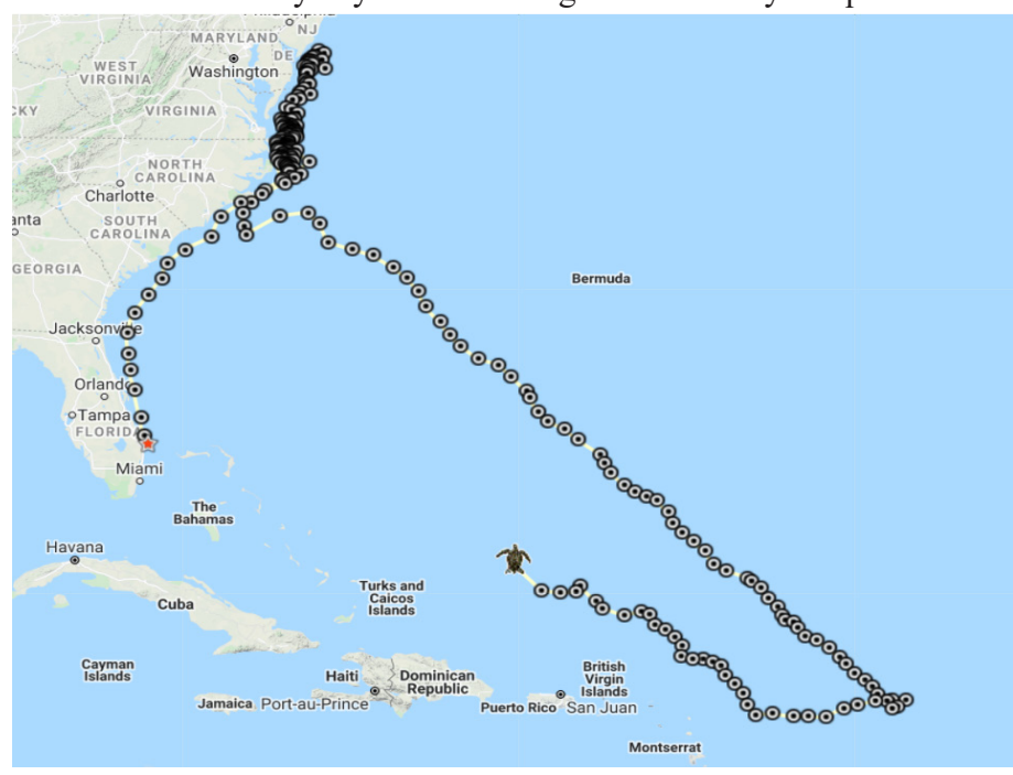
Hope's original migration map which shows the location she stopped transmitting

Hope developed a legion of dedicated fans who enjoyed checking her location online every day and following her incredibly unique track.