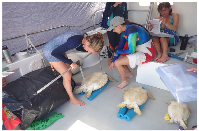
BTP participants measure juvenile green turtles.

Through the Bermuda Turtle Project (BTP), for over 50 years Sea Turtle Conservancy and its partners in Bermuda have been monitoring juvenile sea turtles in their marine environment to track how these animals are doing at a critical life stage. The BTP is unique because it allows for the study of sea turtles in their developmental habitat – a place where young sea turtles from around the Atlantic and Caribbean congregate to grow up.